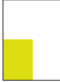
Quarter Page: 3.75" x 4.875"